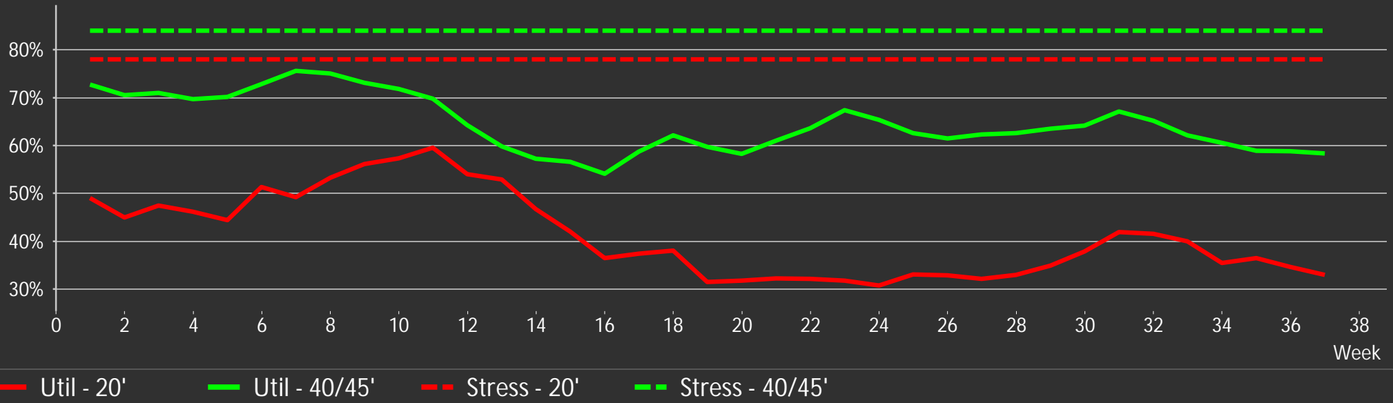
Kansas City Utilization - YTD