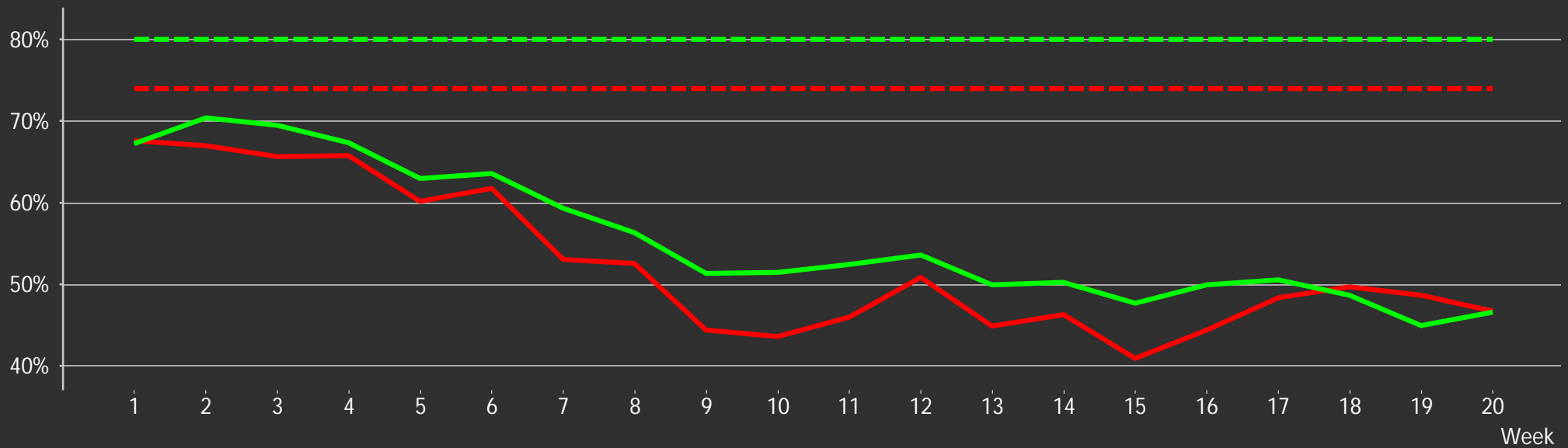
Atlanta Utilization - YTD

Util - 20' Util - 40/45' Stress - 20' Stress - 40/45'