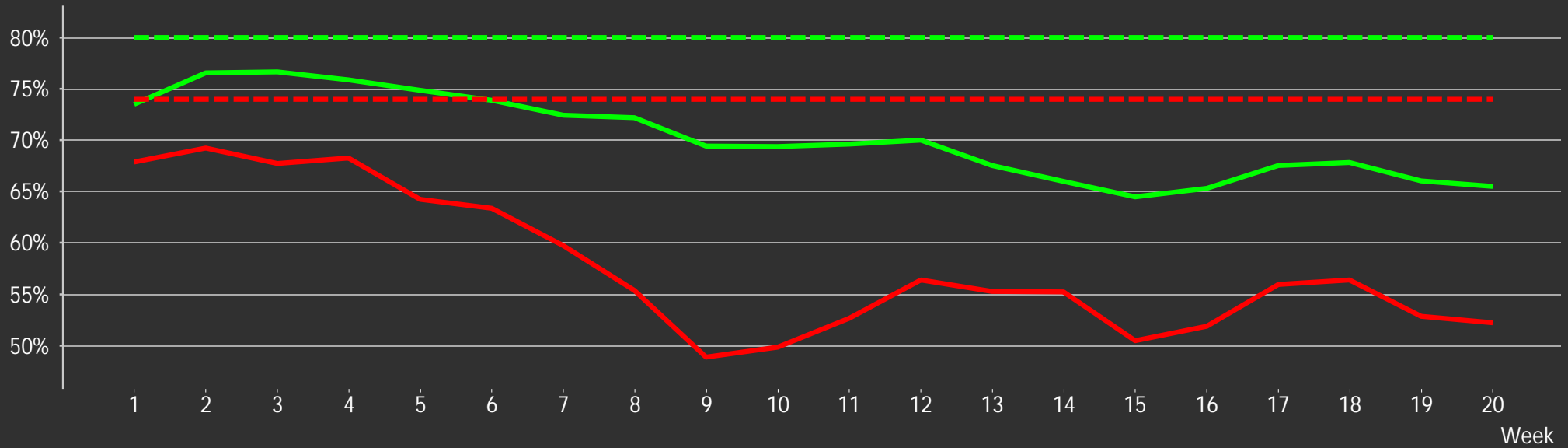
Overall Utilization - YTD

Util - 20' Util - 40/45' Stress - 20' Stress - 40/45'