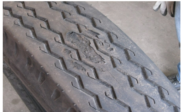
Do Not Replace Tire