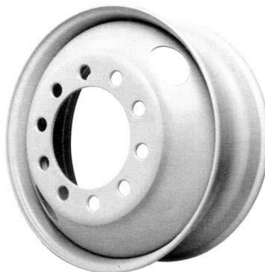
Tubeless Disk Wheel

The 4 most notable differences which we must be concerned with are