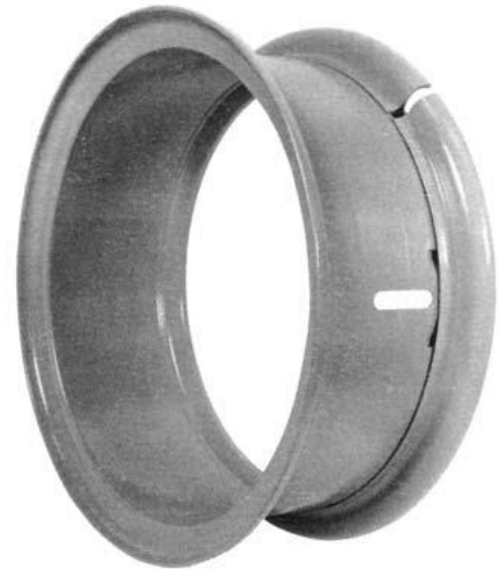
Demountable Multi-piece Tube type rim